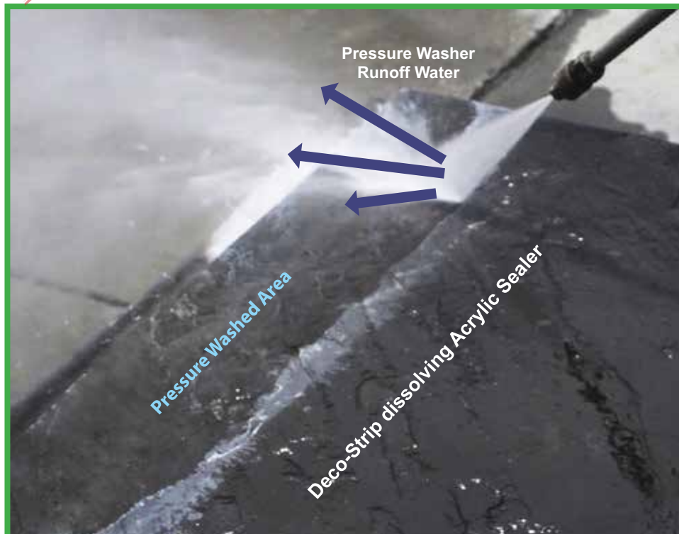
CORRECT PRESSURE WASHING SPRAY METHOD