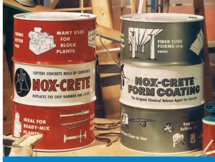
DEACTIVATOR · FORM COATING