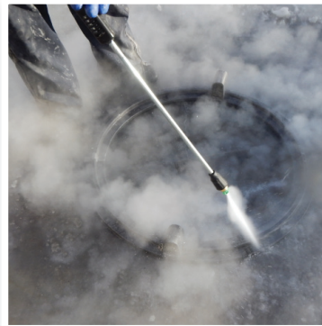
3 Rinse with water