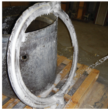
2 Spray apply Kem-Ex-It