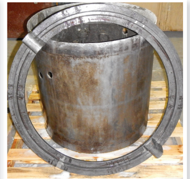
4 Clean, rust-free form ring!