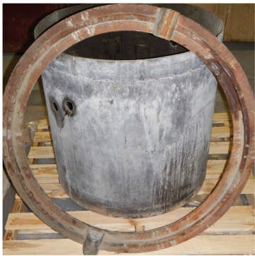
1 Rusty form ring